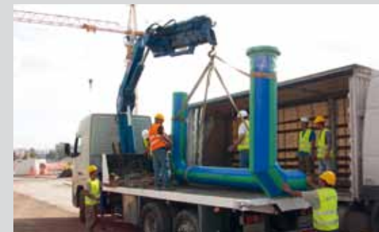
... delivery direct to the construction site.