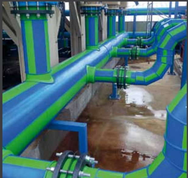
Cooling water pipe system