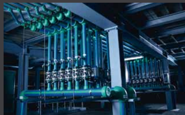
Mixing facility for industrial fluids