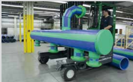
... aquatherm manifold construction.