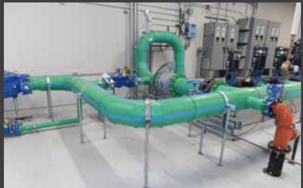
Drinking water pressure increase