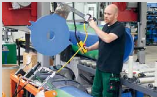
Assembly in the ...