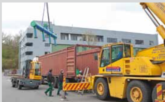
Loading and ...