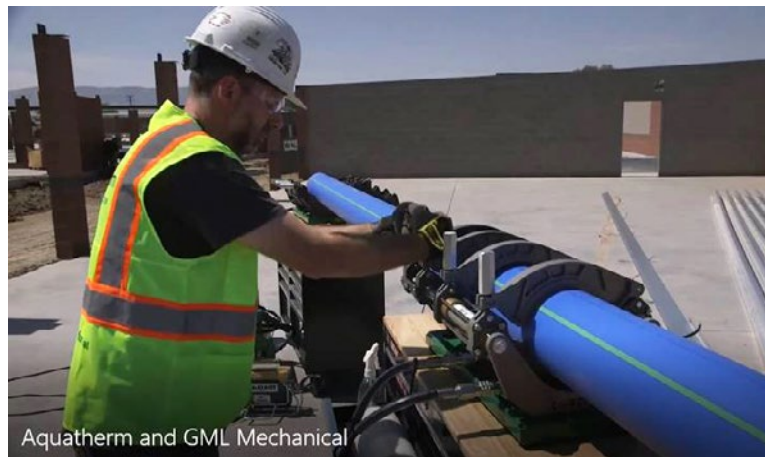
Aquatherm and GML Mechanical

http://www.aquatherm-pipesystems.com/Aquatherm-and-GML-Mechanical.mp4