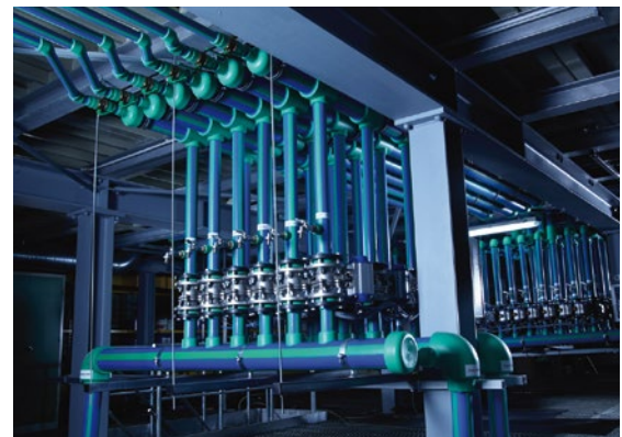
Prefabricated manifold made from aquatherm blue pipe for an industrial application.