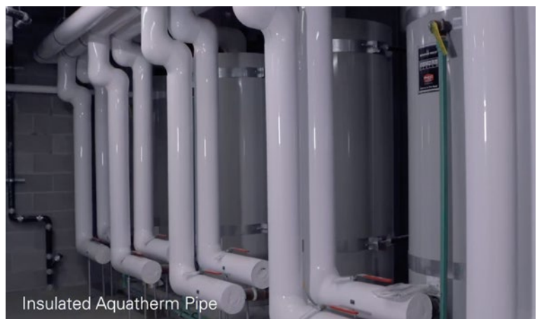
Insulated Aquatherm Pipe