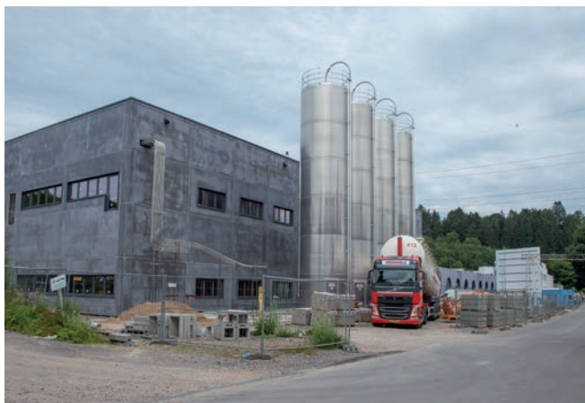
Week 28: First supply of granulate for the trial operation