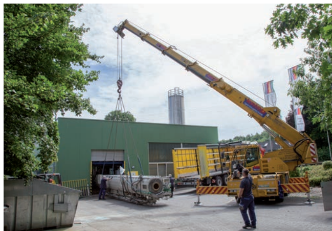
Loading of a ...