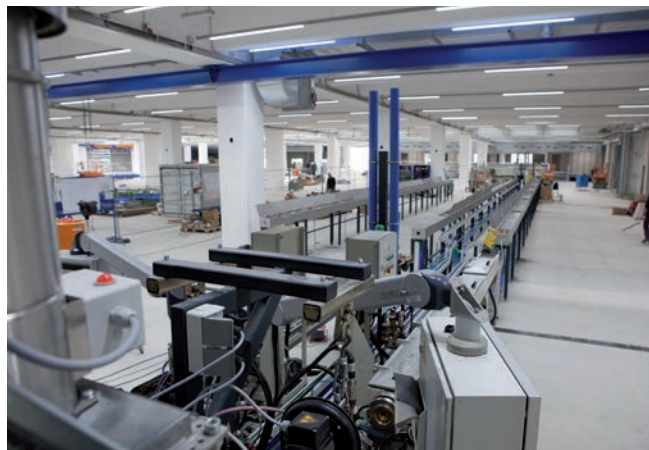
Week 32 Trial operation of the first plant in ZuRo