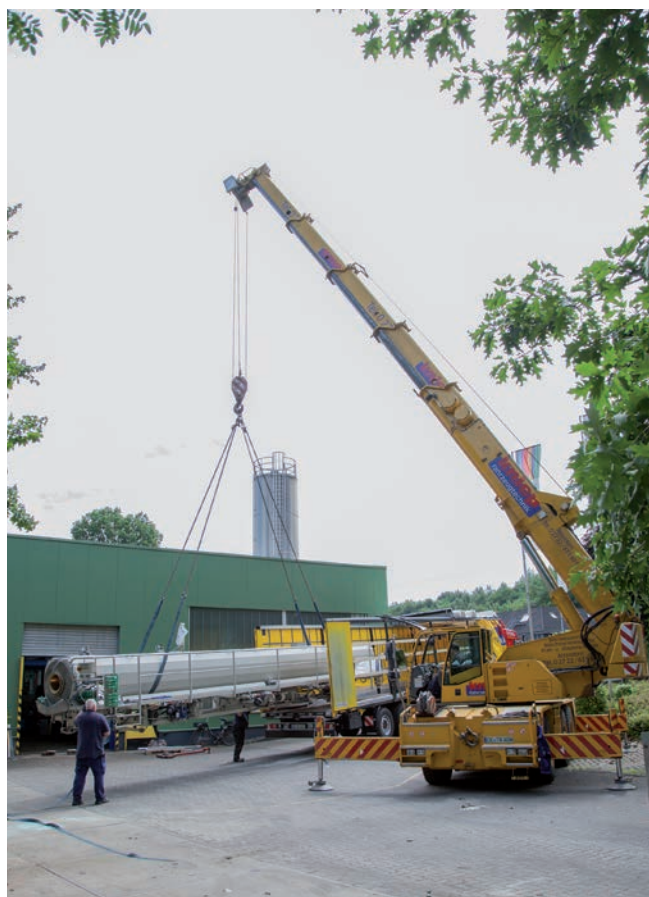
... vacuum tank