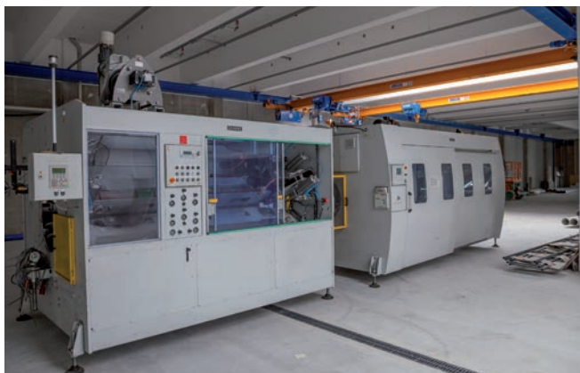
Week 27: Installation of the first plant in the new building