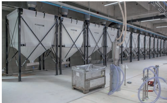
Upstairs the periphery for pipe material supply is formed