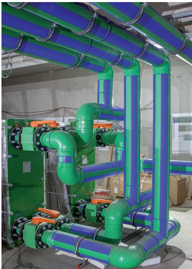
Commissioning of the system for process cooling