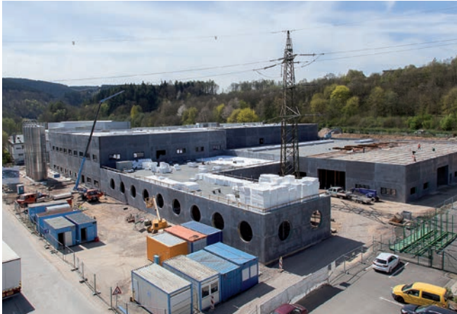
View from the technical office