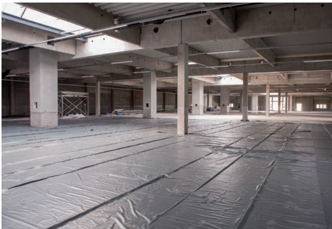
On the upper floor, the periphery for raw material supply is formed