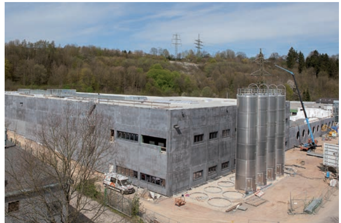
View from the administration building: Here, later on 12 silos will be placed for the supply with raw material

Here are some impressions of the current ZuRo-progress: