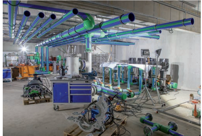
Cooling water treatment in the basement